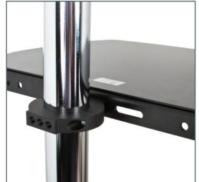
Ideal for mounting accessory shelves to Ø50mm poles