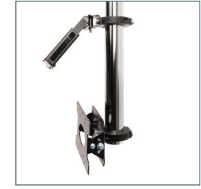
Ideal for a range of mounts and accessories