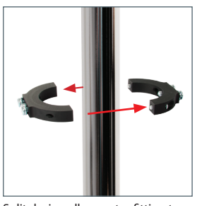
Split design allows retro fitting to existing installations