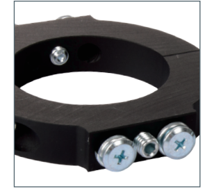
Grub screws provide additional support if necessary