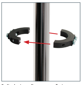
Split design allows retro fitting to existing installations