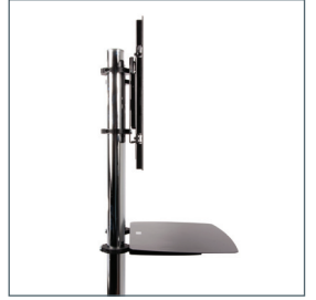
Ideal for mounting accessory shelves to trolleys and floor stands