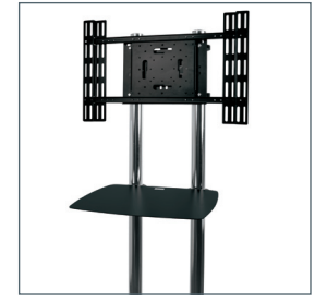
Ideal for a range of mounts and accessories